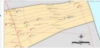
GN/Ward (DS Divisions)