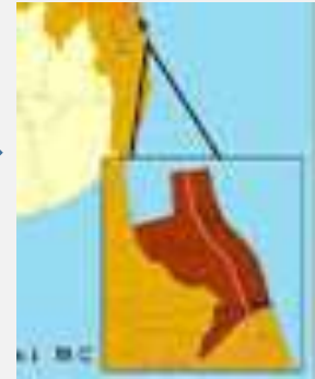
Local Authority (MC/UC/PS)